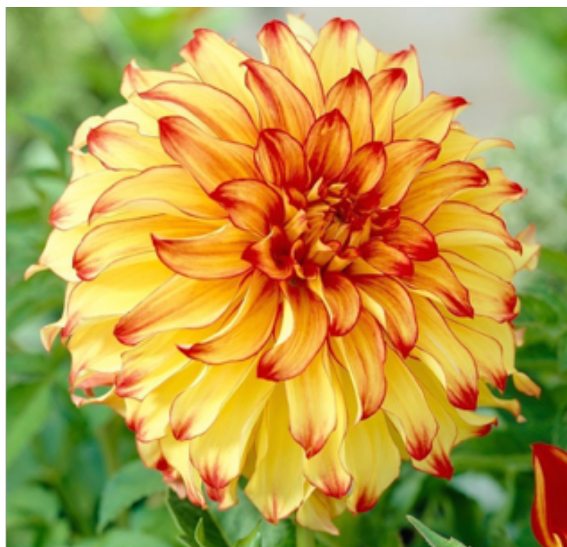
2019 Flowers of the Year