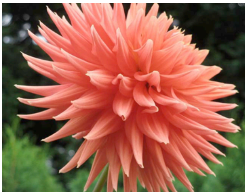
2020 Flowers of the Year Tui Gonnie M FD R (Triple)