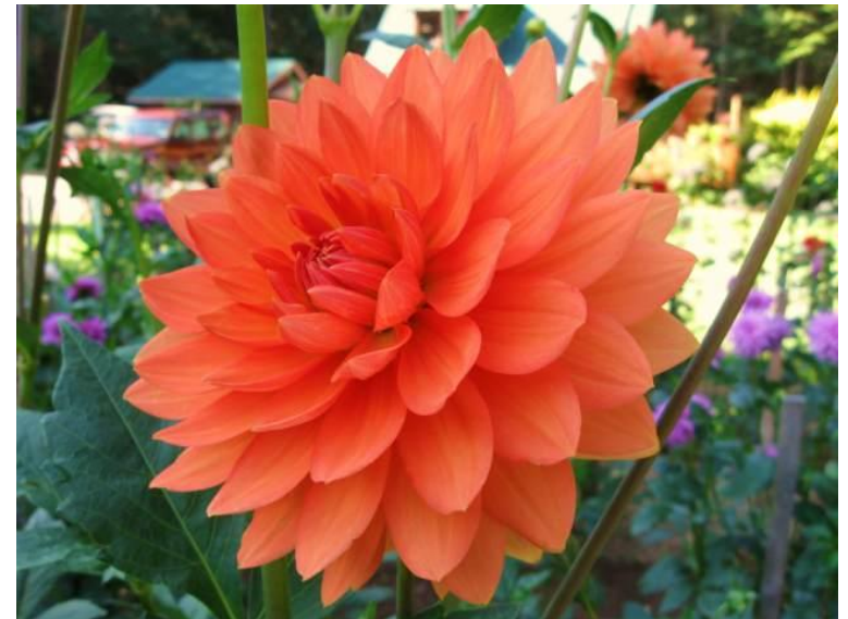
Gwyneth – WL OR