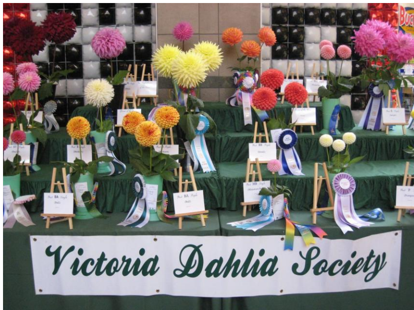
Court of Honour