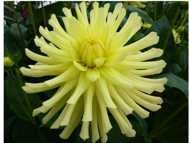
Lakeview Glow – BB IC Y