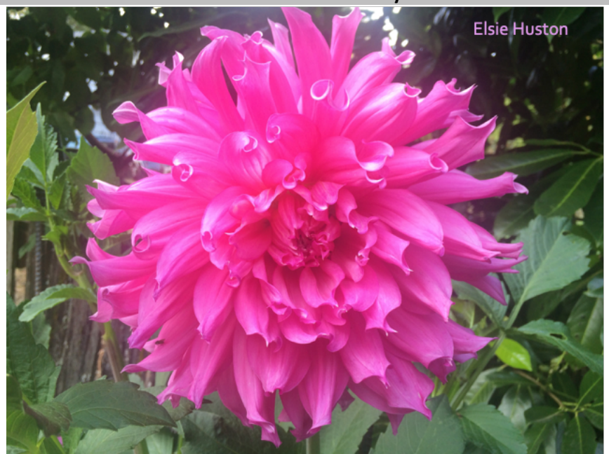
2023 Flowers of the Year