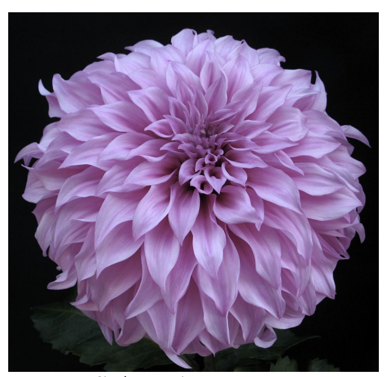
Single – Vassio Meggos A ID L