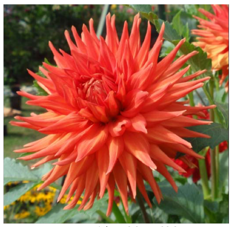
Triple - AC CJ, BB SC OR