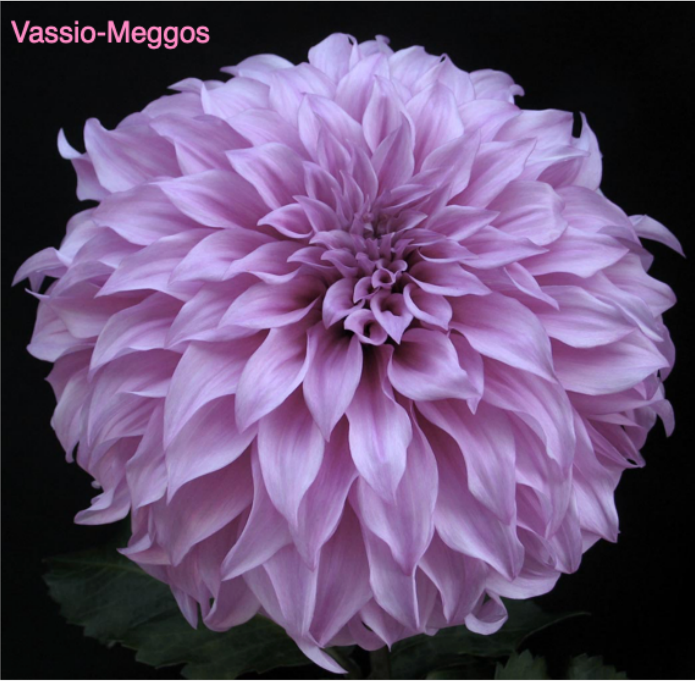
2024 Flowers of the Year